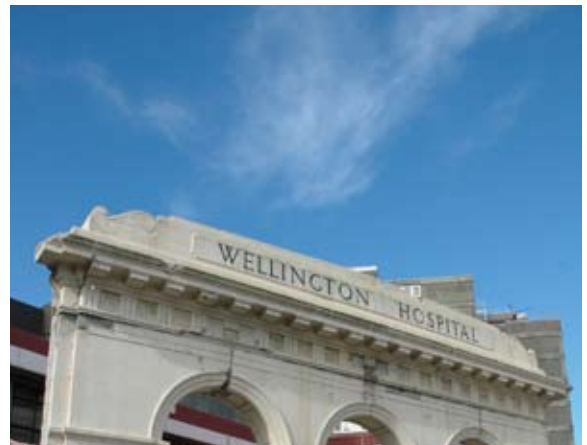
Wellington Public Hospital